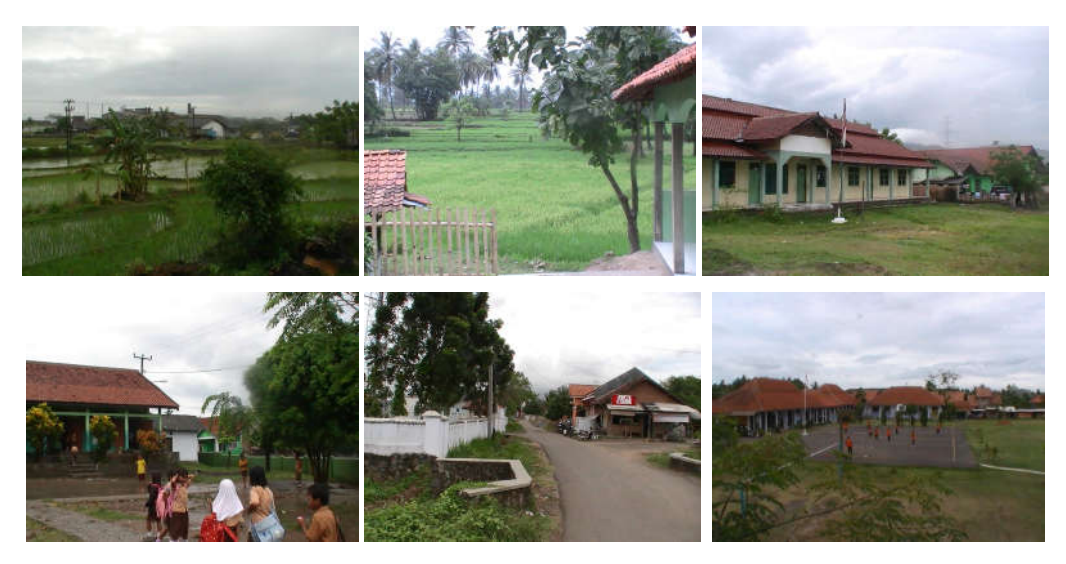
Figure 3. Survey Photos of Bojonegara Sub District, Banten Province, Indonesia