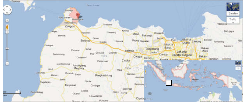
Figure 2. Location of Bojonegara Sub District, Banten Province, Indonesia

Bojonegara is a Sub District of Banten Province, located in a coastal region of Java Island, Indonesia (refer Figure 3). The area, covers 30.30 km<sup>2</sup>.